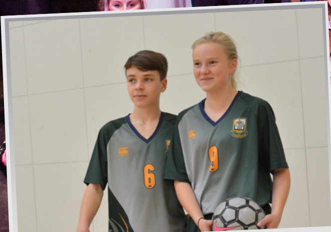
Futsal and Football Academy