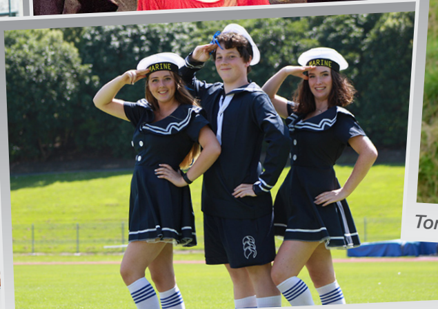
Athletics day fun