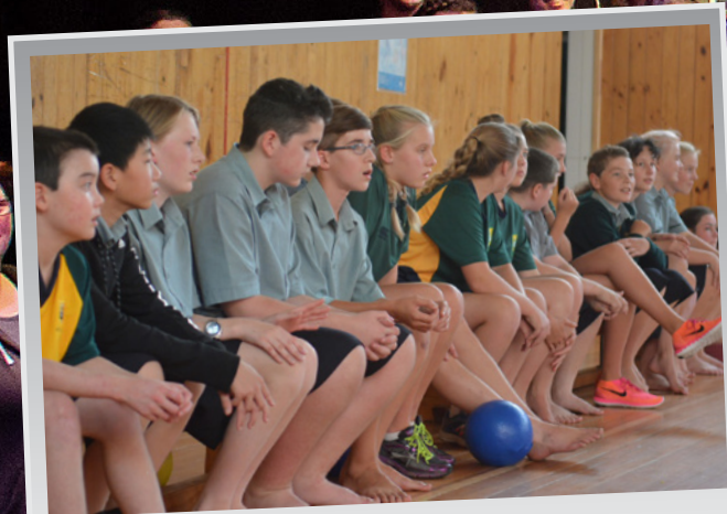
Year 9 - first day at Bayfield