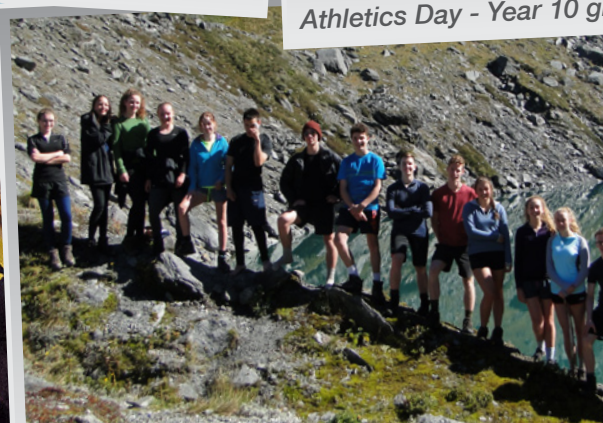
Tramping Club in the Southern Alps