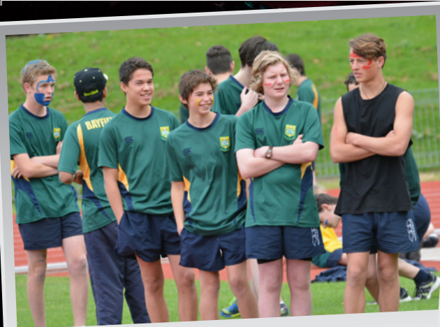
Junior Boys Athletics