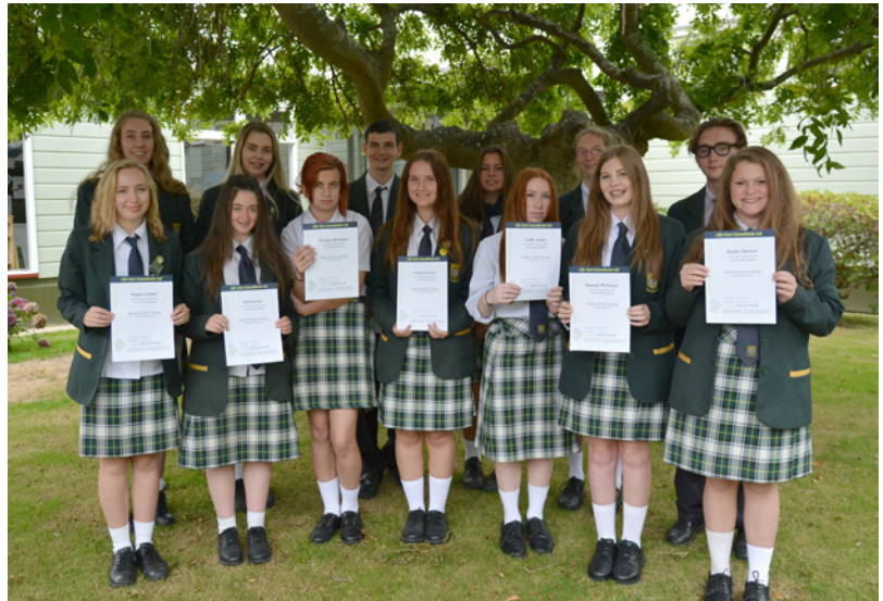
Health and Safety in the Workplace course achievers

Over the past term, a group of Bayfield Students have been taking part in the SDHB's Incubator Programme. This initiative hopes to introduce students who are interested in health professions to a variety of different careers. They have observed different health professionals in their workplaces, such as visiting nurses at the children's ward at the hospital. Students have also had the opportunity to visit the hospital to see the Radiation Therapy and Vascular Departments with the new, multimillion dollar Linear Accelerator radiation treatment machine. During their visit to the Vascular Department, one group were also lucky enough to witness a heart surgery taking place. Talks by St John's Ambulance and caregivers for the elderly have also been very interesting. This is a wonderful programme and it is great to see our students getting involved with it.