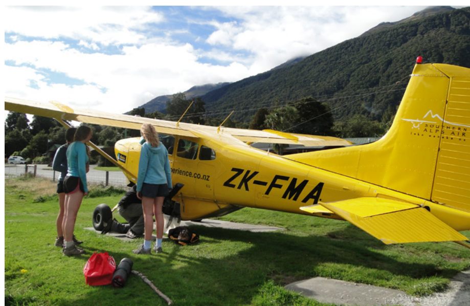
Day 1, the flight in to the Siberian Valley