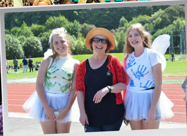
Athletics day fun