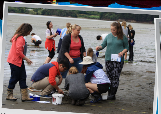
Year 12 Biology field trip