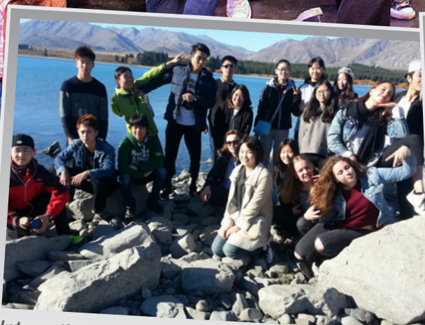
International students visit Mt Cook