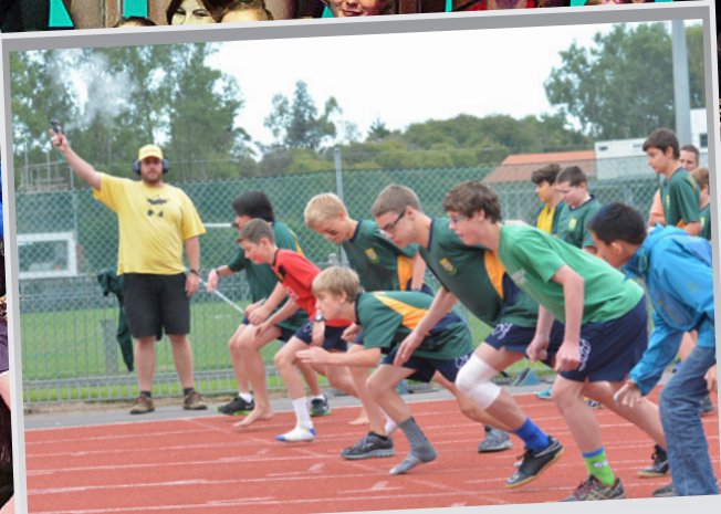
Athletics day - the starter