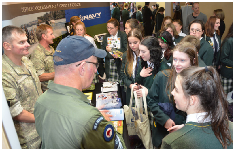
Defence Force booth - Careers Expo