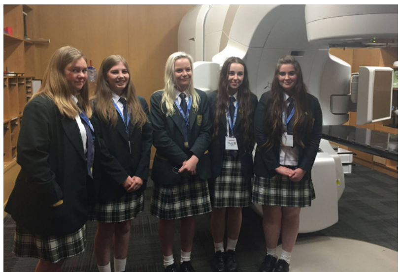
Linear Accelerator - the SDHB Incubator programme