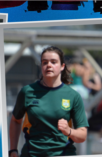
Athletics Day - Year 10 g