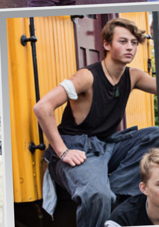
Footloose - the show