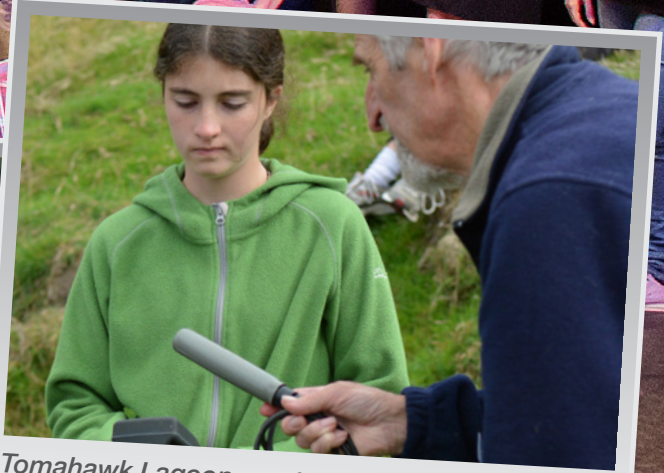
Tomahawk Lagoon - water quality project