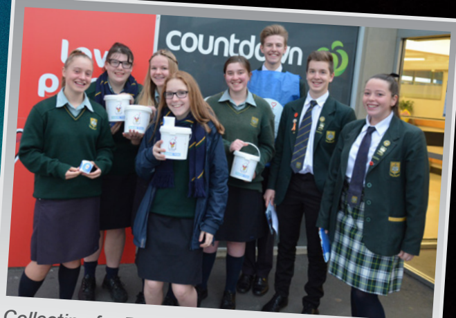
Collecting for Ronald McDonald appeal