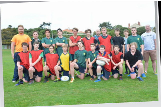
Junior Boys Rugby