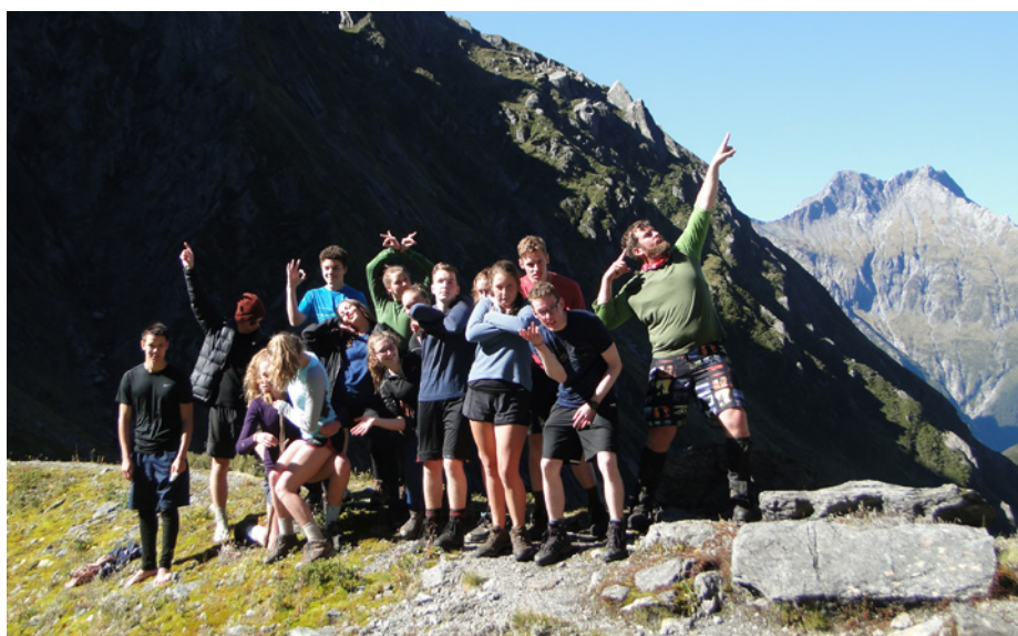
Day trip to alpine Lake Crucible