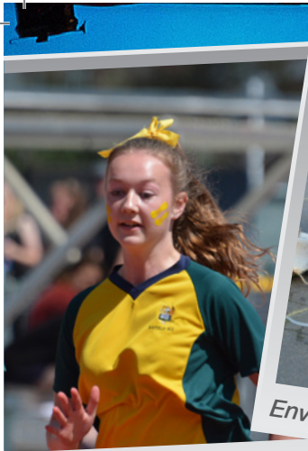
0 girls 200m