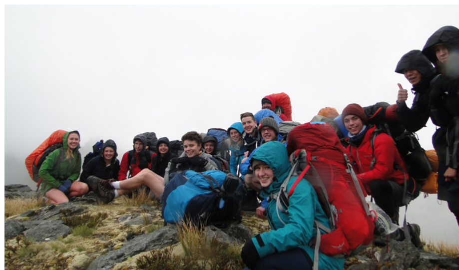
Summiting Gillespie Pass