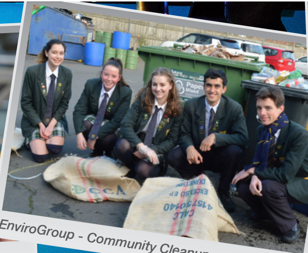
EnviroGroup - Community Cleanup